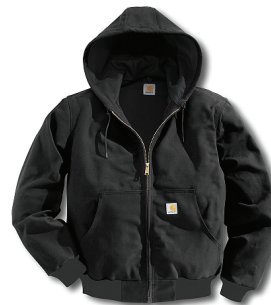
Thermal Lined Active Jac UJ131 $83 $10.00 extra for Big & Talls Union Made in USA

Choose your design - choose your garment - add local @ at no extra charge 100% union Call for quantity pricing - 262-373-0777