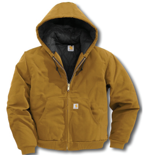
UJ140 $93.00 Duck Active Jacket Quilted Flannel Lined Union Made in USA $10.00 extra for big & talls