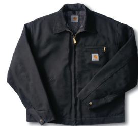
Duck Detroit Jacket UJ01 $73 $10.00 extra for big & talls Union Made in USA