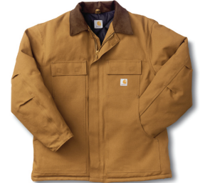
Duck Traditional Coat UCO3 $113 $10.00 extra for Big & Talls Union Made in USA